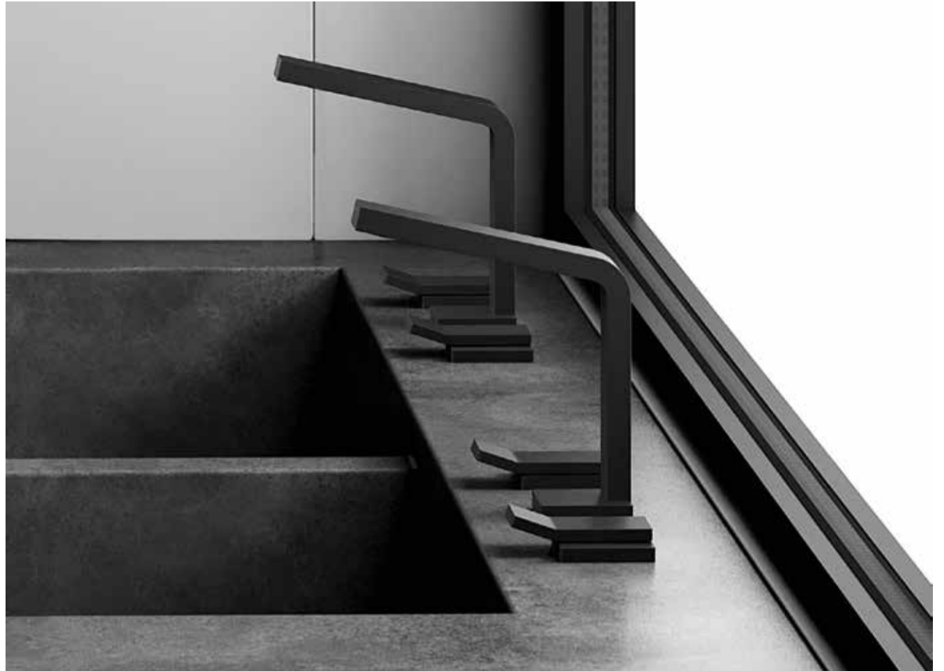
Hall 4.1 | B04