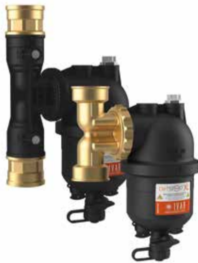
Hall 6 | B10

IVAR will bring innovative solutions for new generation systems with heat pumps, heat and domestic water metering systems, satellite modules and other solutions for the prevention of legionellosis, in addition to mixing and distribution units for radiant systems. Wireless thermostats, thermostatic heads, press fittings and sanitary manifolds complete the range. Among the leading products we find the swiveling magnetic dirt separator with triple filtering action Dirtstop® XL , the ideal solution even in systems with high flow rates. The metal parts of the heating system are subject to corrosion effects, which release ferrous impurities into the water. Other impurities may also be present, for example due to limescale, and they