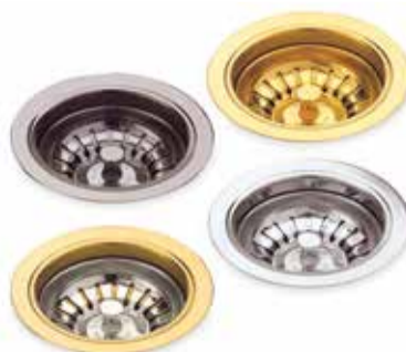
Hall 4.2 | D31

Lira's Basket drain fitting , an essential accessory in high quality sinks, is available in a rich variety of finishes: satin, bright and pearl, in the colors Chrome, Anthracite, Bronze, English Bronze, Copper, Iron, Nickel, Gold, Gold 24K and White Gold. It is suitable for sinks in stainless steel, synthetic materials and ceramic. It has a diameter of 90 mm to speed up the drainage system